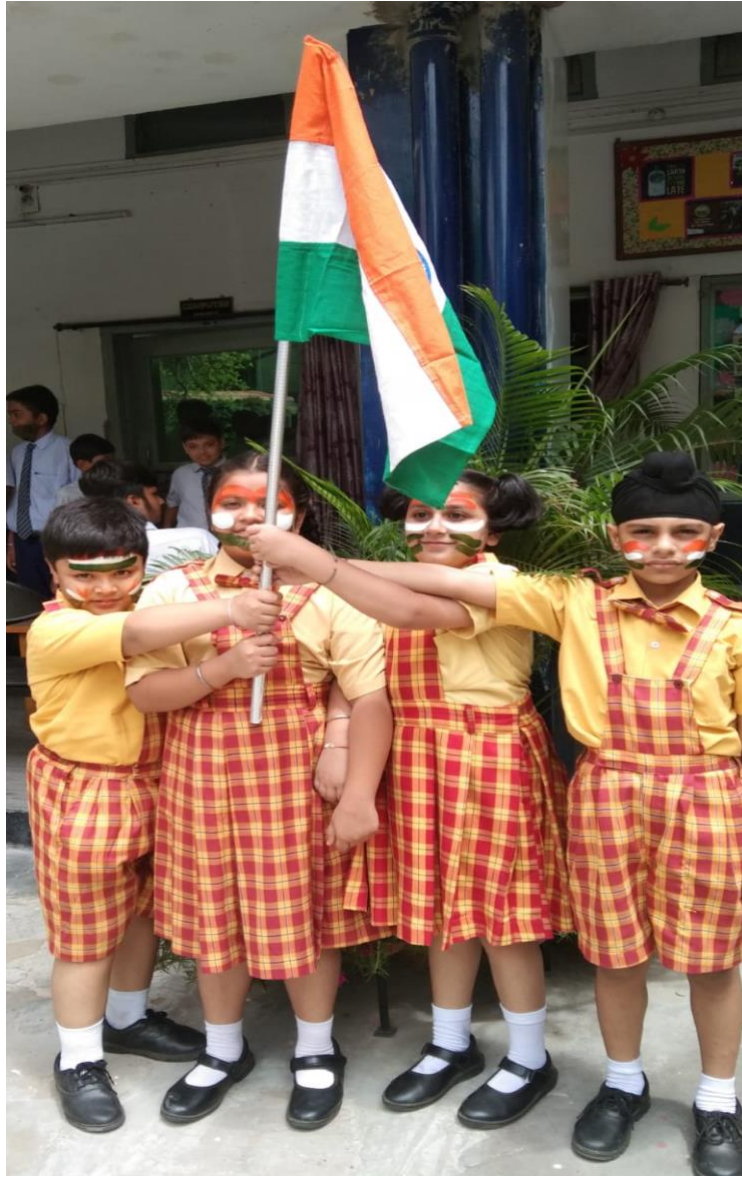
The Patriots of Independent India