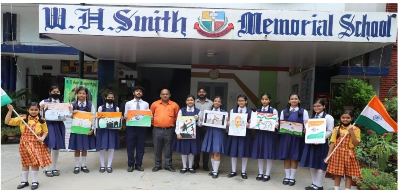
Students with PAINTINGS on I Love My Country